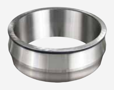
Inner Ring SRB Windmill, Radar Station Hard turning/grinding External or Internal/ External and Internal